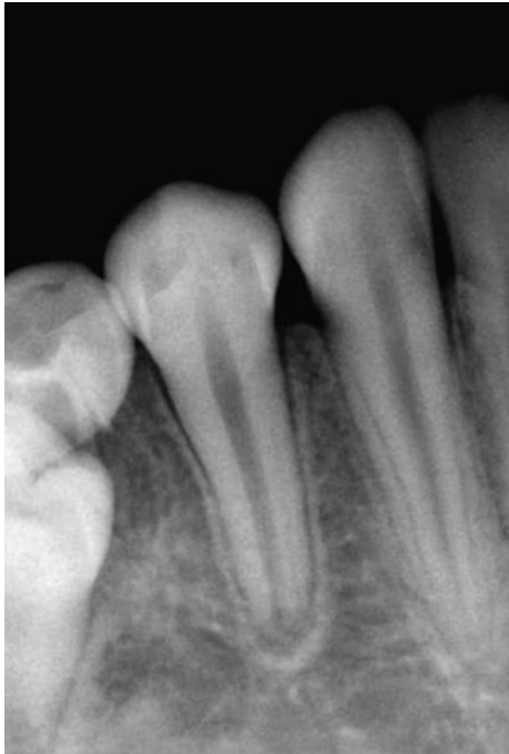
Fig. 8. Periapical radiograph of contralateral premolar comparing root development at 11 months postoperative.

observed for the lower left first premolar as well as for the contralateral lower right first premolar. Root maturation was observed to have significantly progressed when compared with the preoperative radiographs and was similar to the status of root development and maturation of the contralateral premolar (Figs 7 and 8). The patient was scheduled for routine recall visits every 6 months. The parents were informed about the potential need for root canal therapy in case of signs and symptoms.