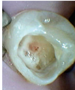
Fig. 2. Disinfection of exposure site by rinsing with 5.25% sodium hypochlorite.