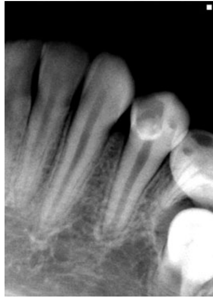
Fig. 6. Follow-up periapical radiograph at 4 months presenting with continued root development.

Four months later, clinical examination revealed an intact restoration and absence of any abnormal