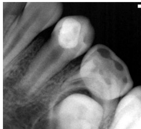
Fig. 3. Immediate postoperative periapical radiograph showing pulp capping with MTA, cotton and temporary filling material.