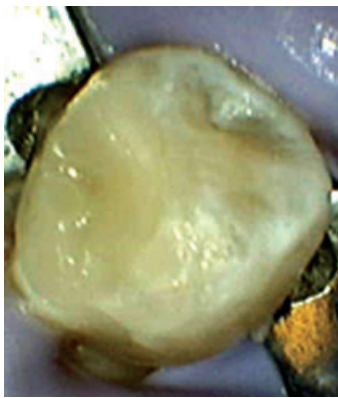
Fig. 5. Final coronal restoration with composite.

plastic carrying instrument. The mix was then padded with a moist cotton pellet to ensure optimum contact of MTA with exposed pulp tissue. A moist cotton pellet was then placed over the MTA and the rest of the cavity was restored with temporary filling material (Tempit, Centrix Inc, Shelton, CT, USA; Fig. 3). The patient was scheduled after 48 h to evaluate the setting of MTA and also to follow up on any abnormal symptoms.