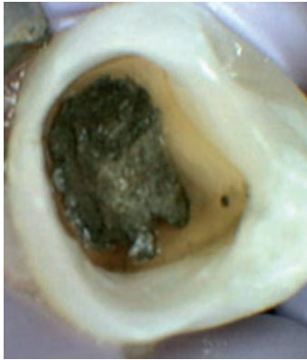
Fig. 4. Verification of the setting of MTA at 48 h.