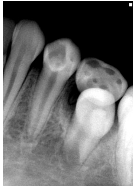
Fig. 7. Follow-up periapical radiograph at 11 months showing maturogenesis of the root.

signs or symptoms. The lower left first premolar tested positive and normal to thermal pulp stimulation with cold. A periapical radiograph showed continued development and maturation of the root (Fig. 6).