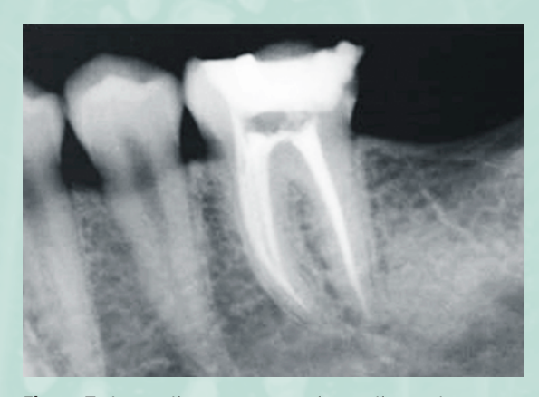
Figure 7. Immediate postoperative radiograph.