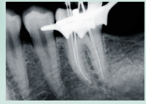
Figure 4. Radiograph with instruments placed at working lengths determined by an apex locator.