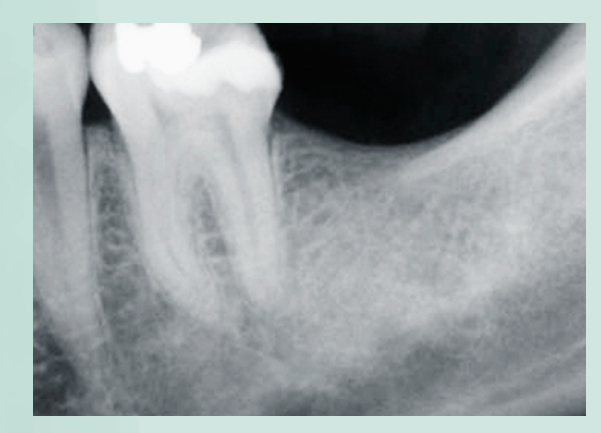
Figure 1. Preoperative radiograph of tooth #19(36) is indicative of a fractured distal marginal ridge with recurrent caries

In this case, the confluent middle mesial canal joined the mesiobuccal canal at the apical third; the mesiolingual canal remained separate (Figures 5 and 6). The two distal canals joined to exit in a single foramen. The canals were instrumented with hand and nickeltitanium rotary endodontic instruments (eg, ProTaper, Dentsply Tulsa Dental, Tulsa, OK; K3, Sybron Endo, Orange, CA). Alternating irrigations of 5.25% sodium hypochlorite and 17% ethylenediamine tetraacetic acid (EDTA) were used, and final irrigation was performed with 0.12% chlorhexidine followed by a local anesthetic solution. The canals were obturated with laterally condensed resin-coated guttapercha (ie, EndoREZ points and EndoREZ